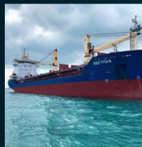
Shipping & Logistics